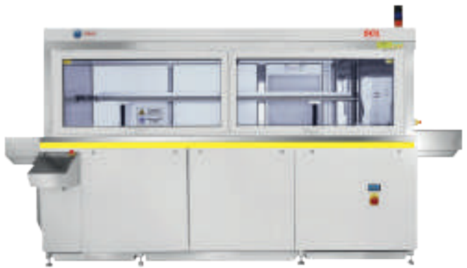
ULTRASONIC CLEANING AT ITS BEST