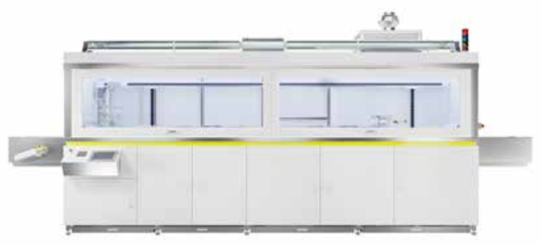
ULTRASONIC CLEANING AT ITS BEST